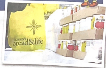
Food donations from St. John's Bread & Life.