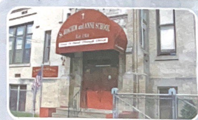
This edition of The Tablet Jr. was created with the contributions of student journalists from Ss. Joachim and Anne School, Queens Village, New York.

Though African Americans struggled, they could eventually do so much because of their perseverance. This should be discussed during Black History Month and is an example of God helping you accomplish things during difficult times.