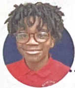
by Maximilien Julien Grade 8

The digital world was revolutionized by this one man, which shows that you should never give up on what you believe you can do!